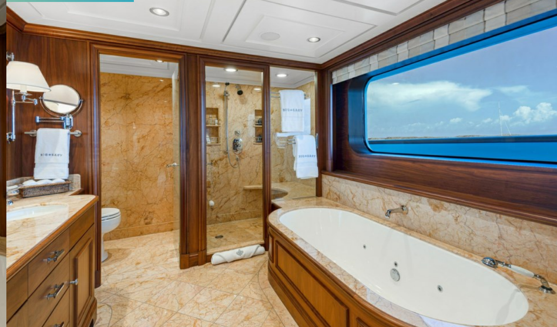
Master cabin en suite