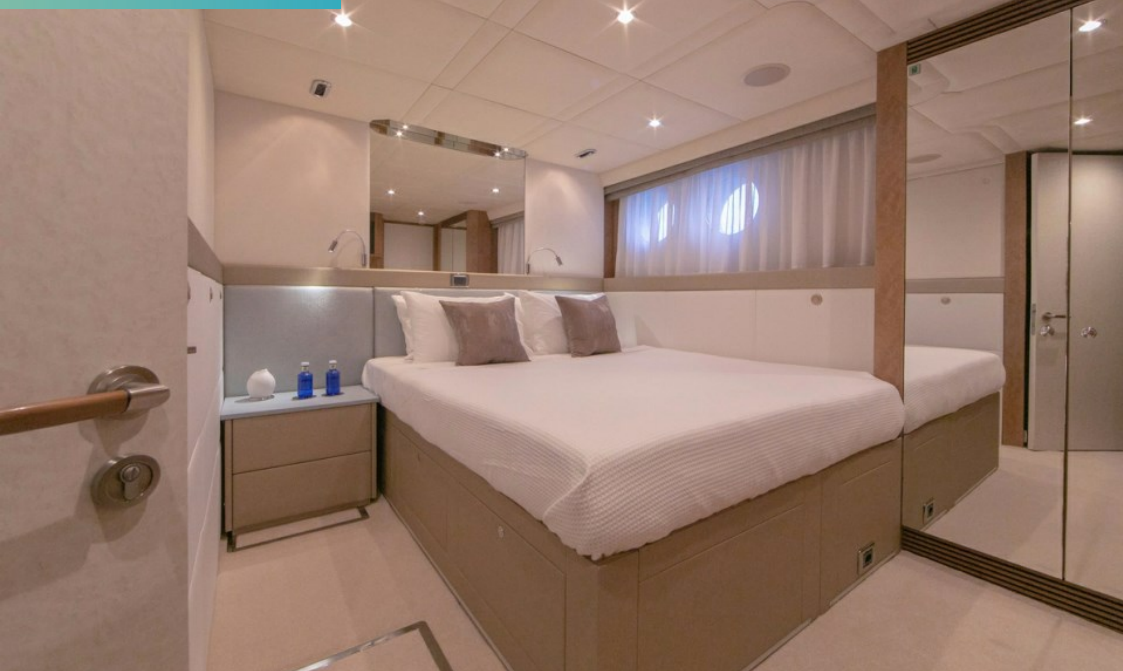
Convertible double/twin cabin