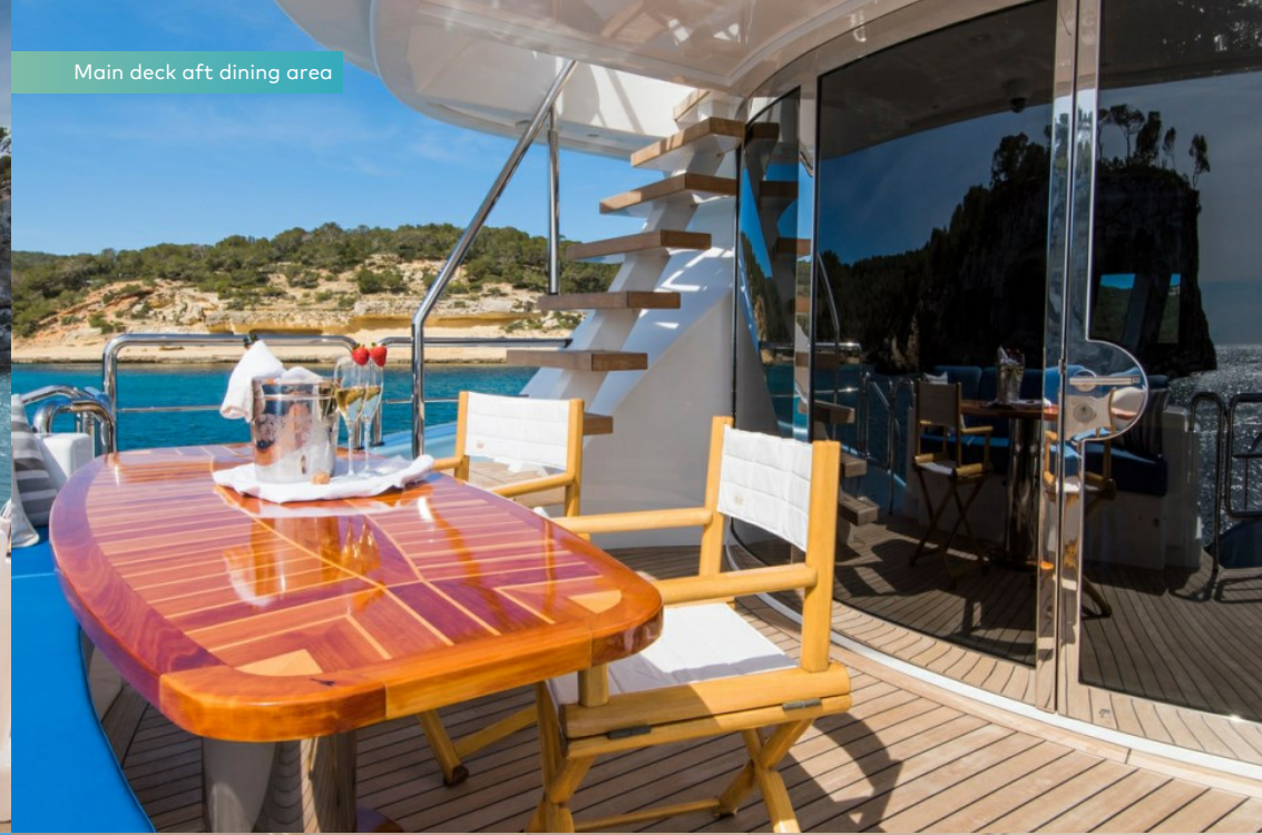
Main deck aft dining area