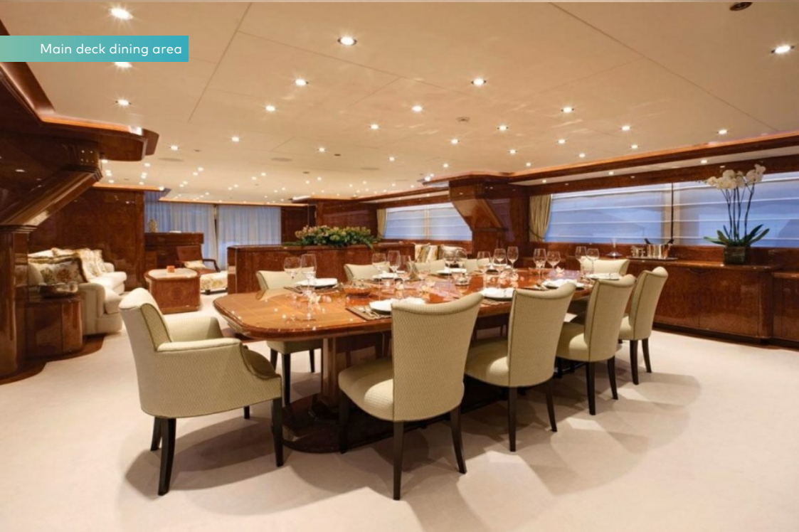
Main deck dining area