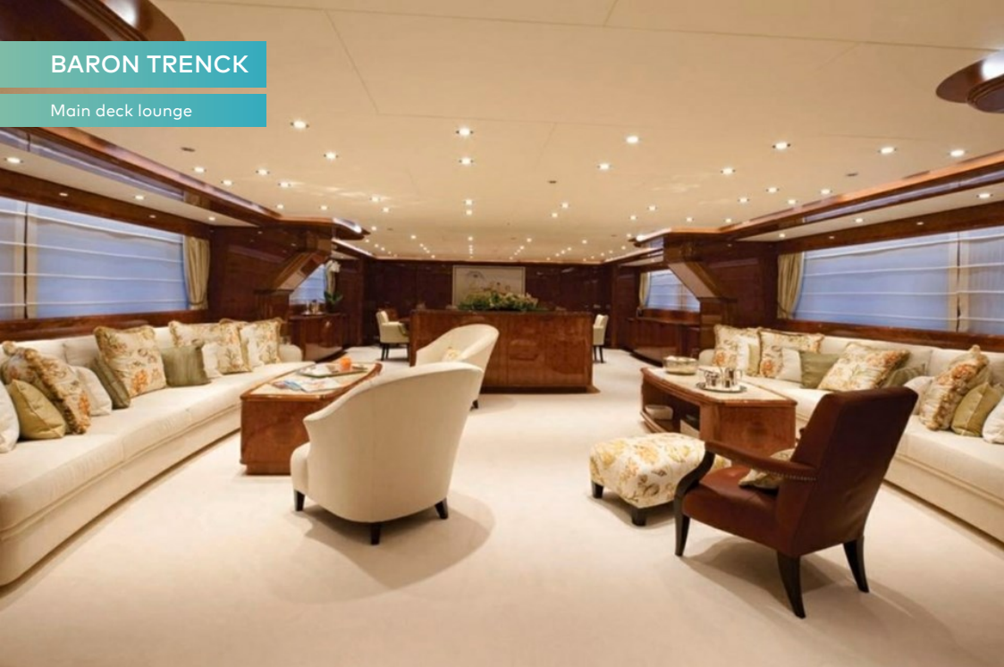
Main deck lounge