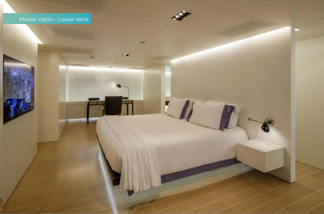
Master cabin - Lower deck