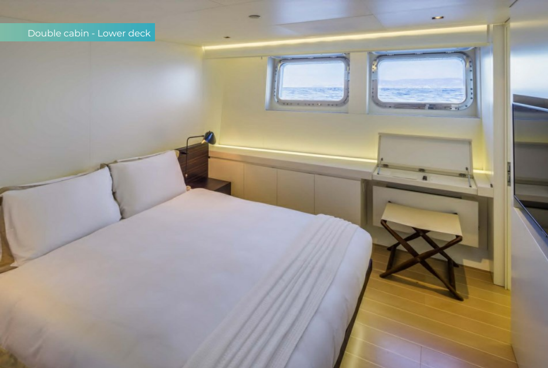
Double cabin - Lower deck