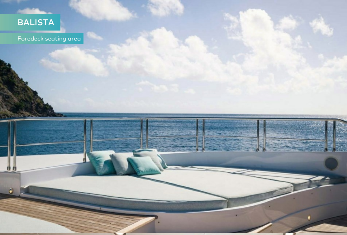
Foredeck seating area