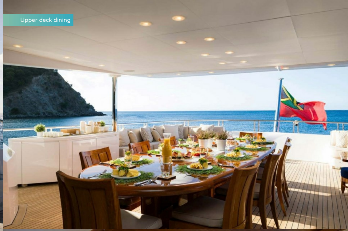
Upper deck dining