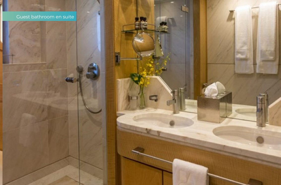
Guest bathroom en suite