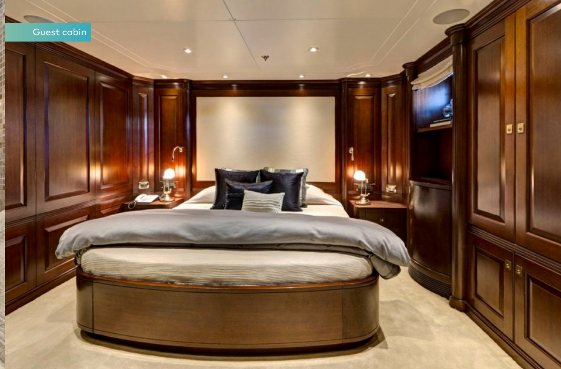
Guest en suite