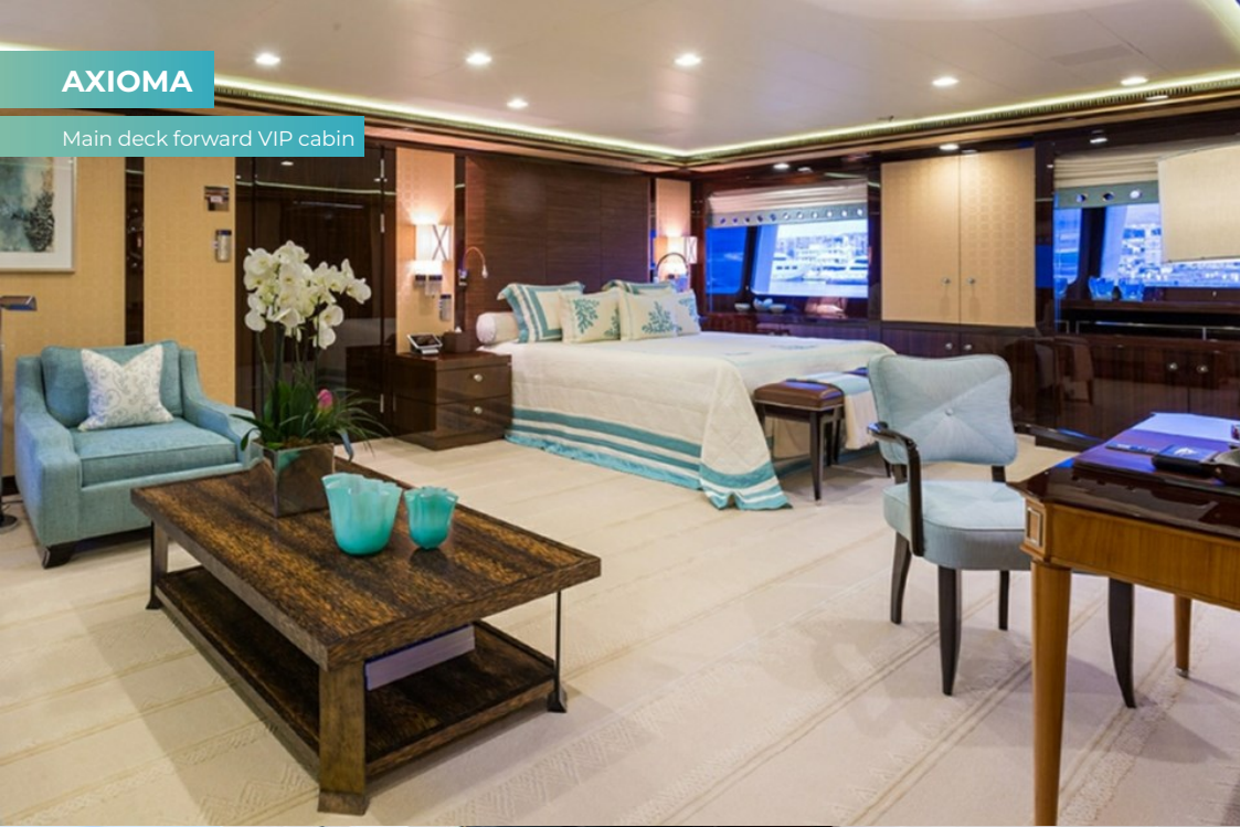
Main deck forward VIP cabin