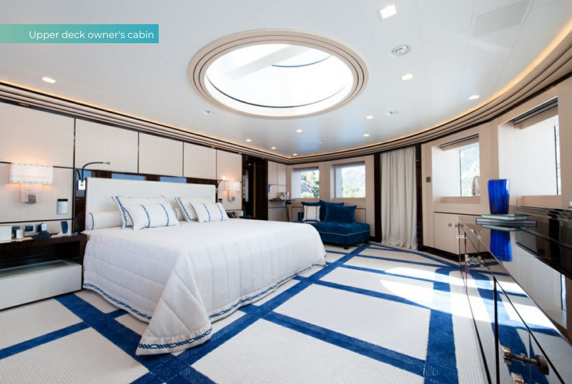
Upper deck owner's cabin