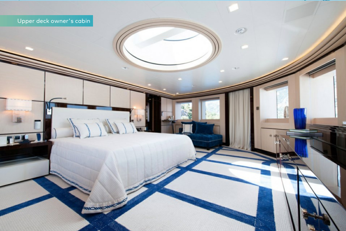
Upper deck owner's cabin