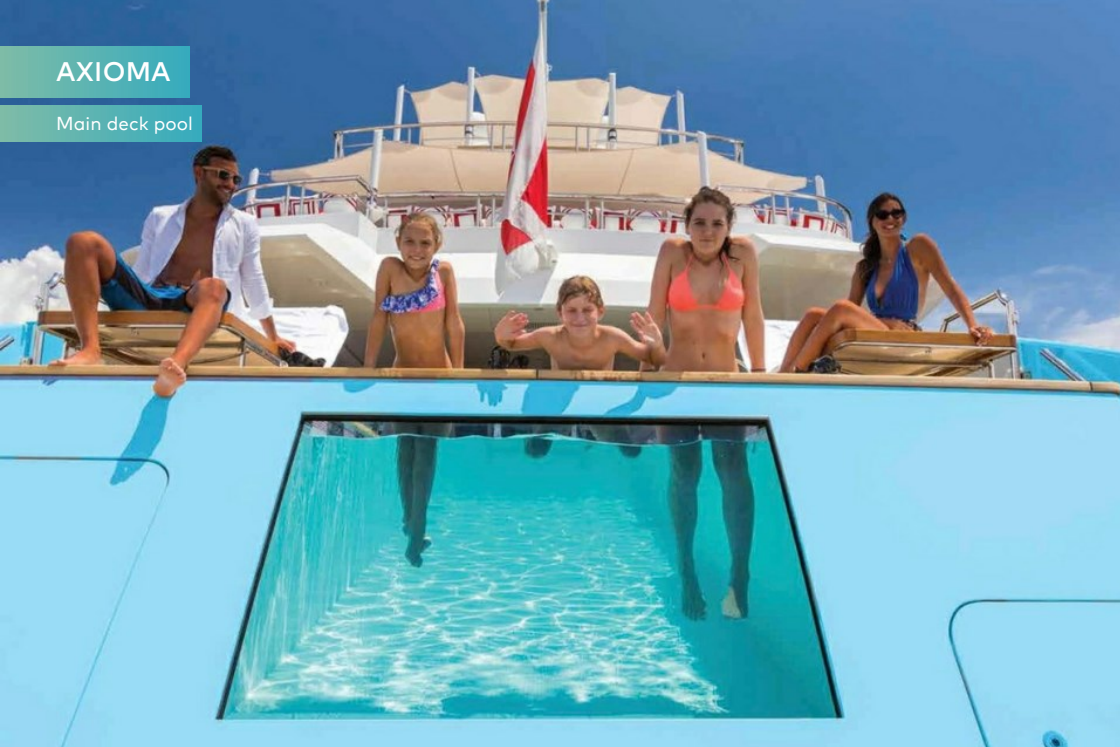
Main deck pool