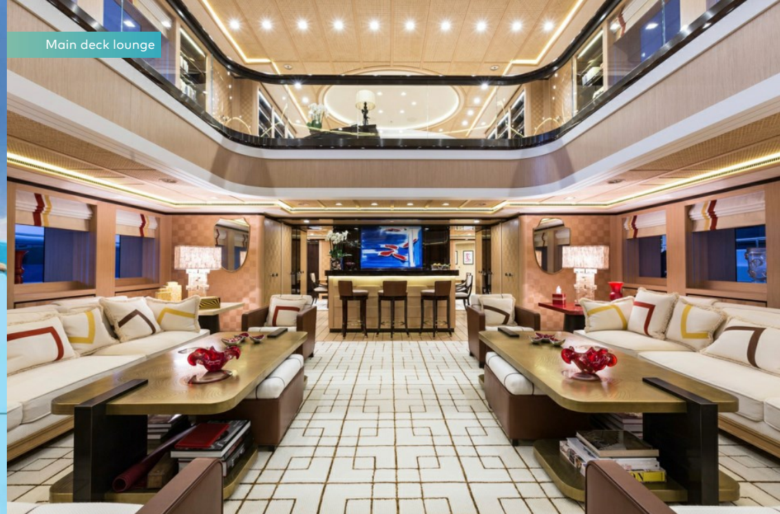
Main deck lounge