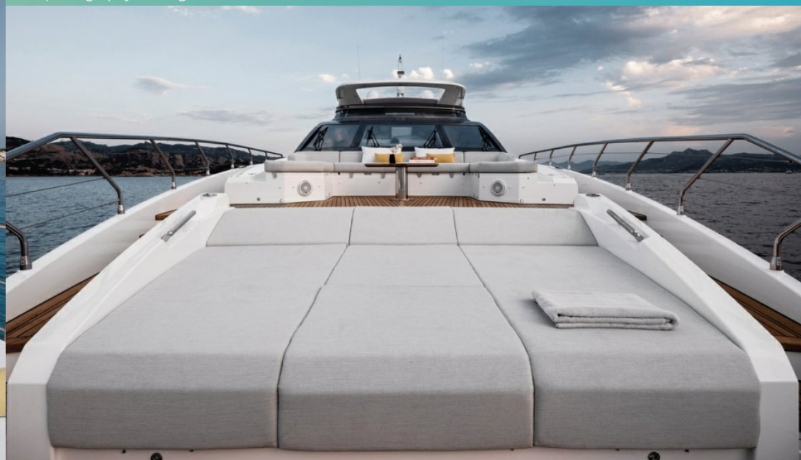
Flybridge forward seating and lounging area - image courtesy of Azimut and the Grande 27M model. ASR photography coming soon