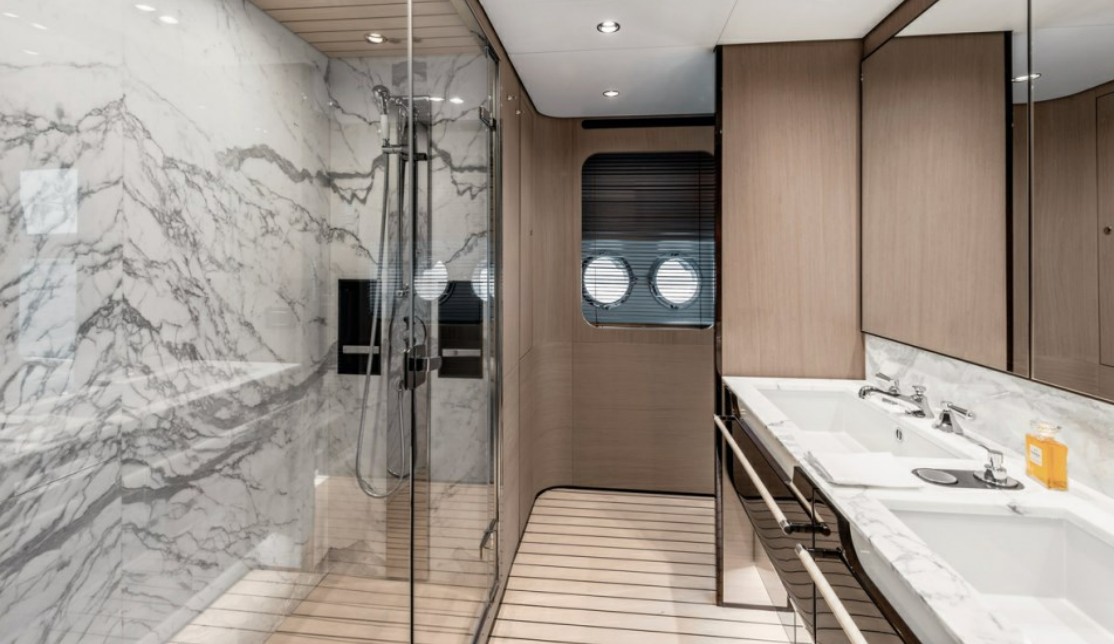
Main deck master cabin en suite - image courtesy of Azimut and the Grande 27M model. ASR photography coming soon