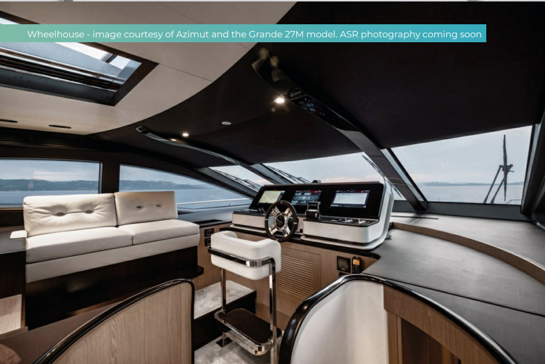
Wheelhouse - image courtesy of Azimut and the Grande 27M model. ASR photography coming soon