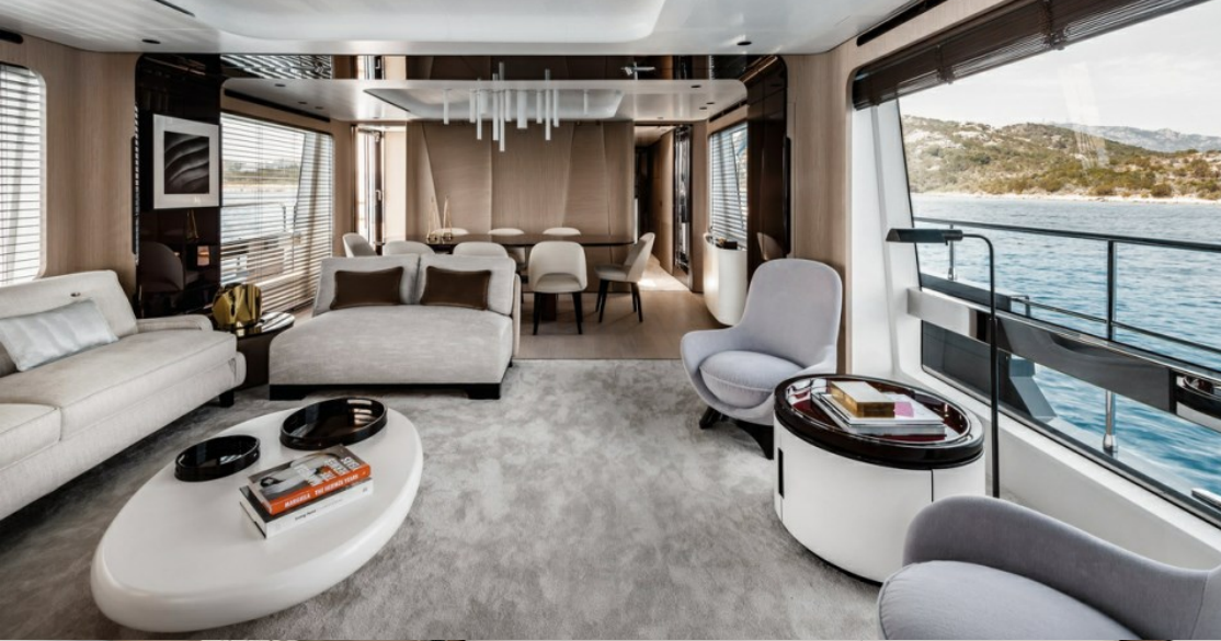
Main deck lounge and dining area - image courtesy of Azimut and the Grande 27M model. ASR photography coming soon