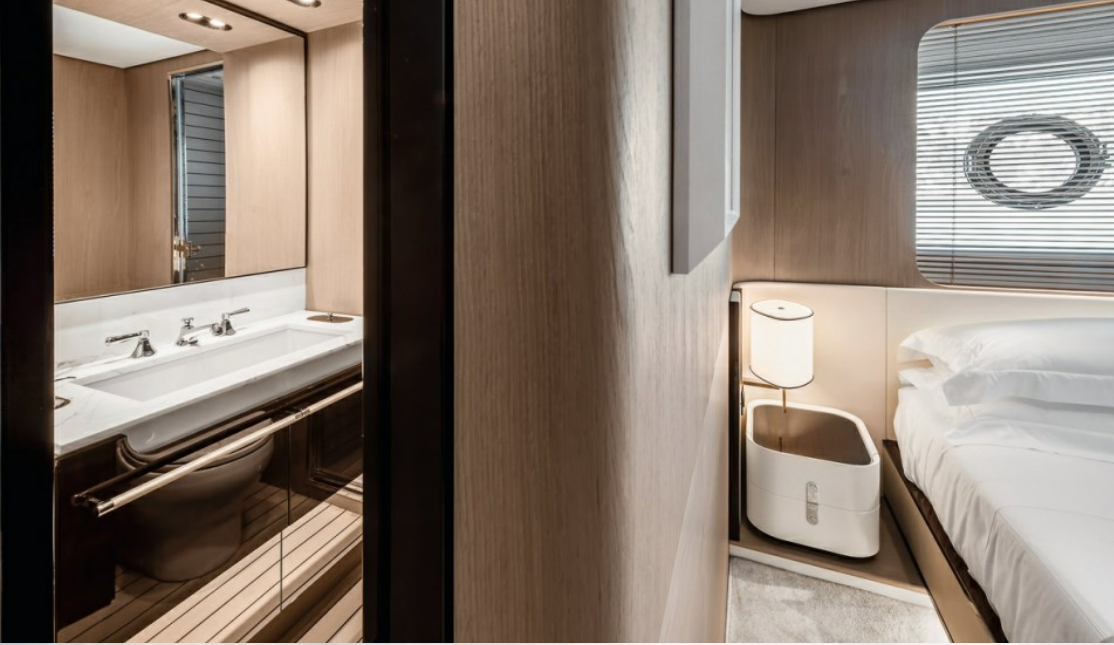
Lower deck double guest cabin en suite - image courtesy of Azimut and the Grande 27M model. ASR photography coming soon