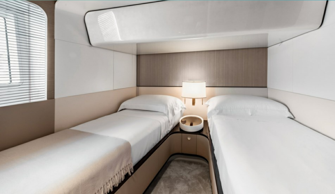
Lower deck twin guest cabin - image courtesy of Azimut and the Grande 27M model. ASR photography coming soon