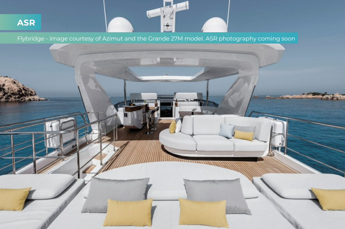
Flybridge - image courtesy of Azimut and the Grande 27M model. ASR photography coming soon