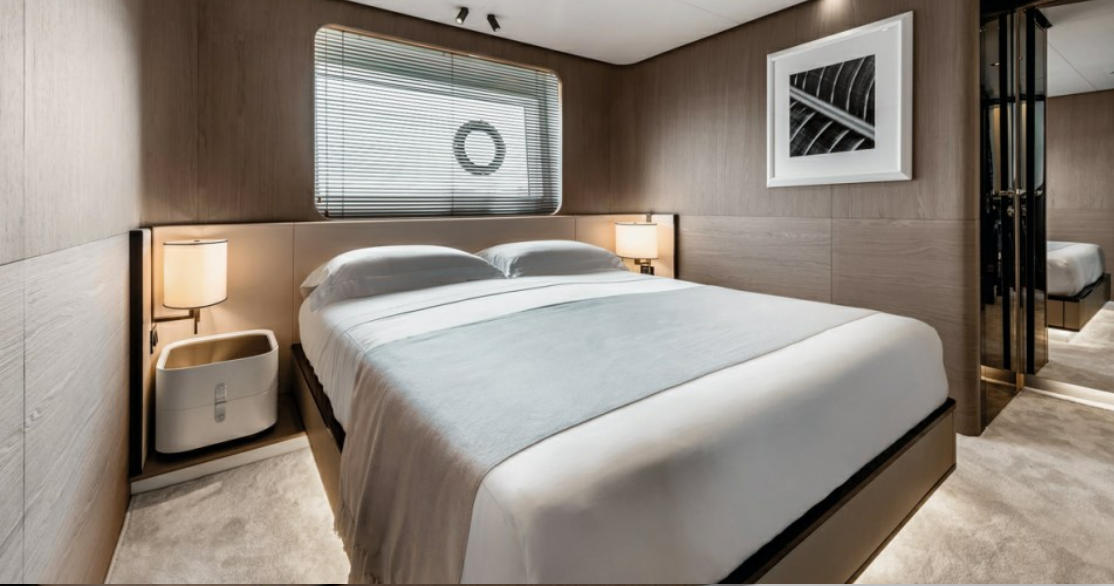
Lower deck double guest cabin - image courtesy of Azimut and the Grande 27M model. ASR photography coming soon