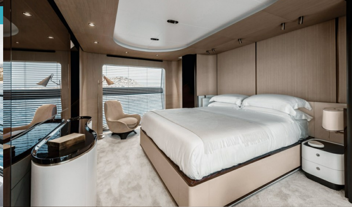
Main deck master cabin - image courtesy of Azimut and the Grande 27M model. ASR photography coming soon