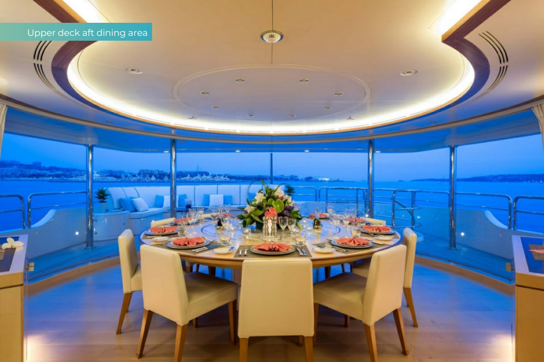
Upper deck aft dining area