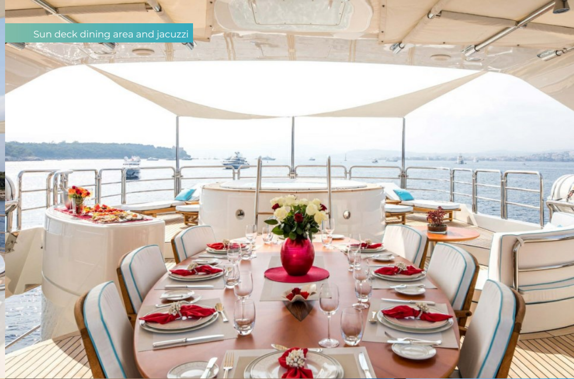
Sun deck dining area and jacuzzi