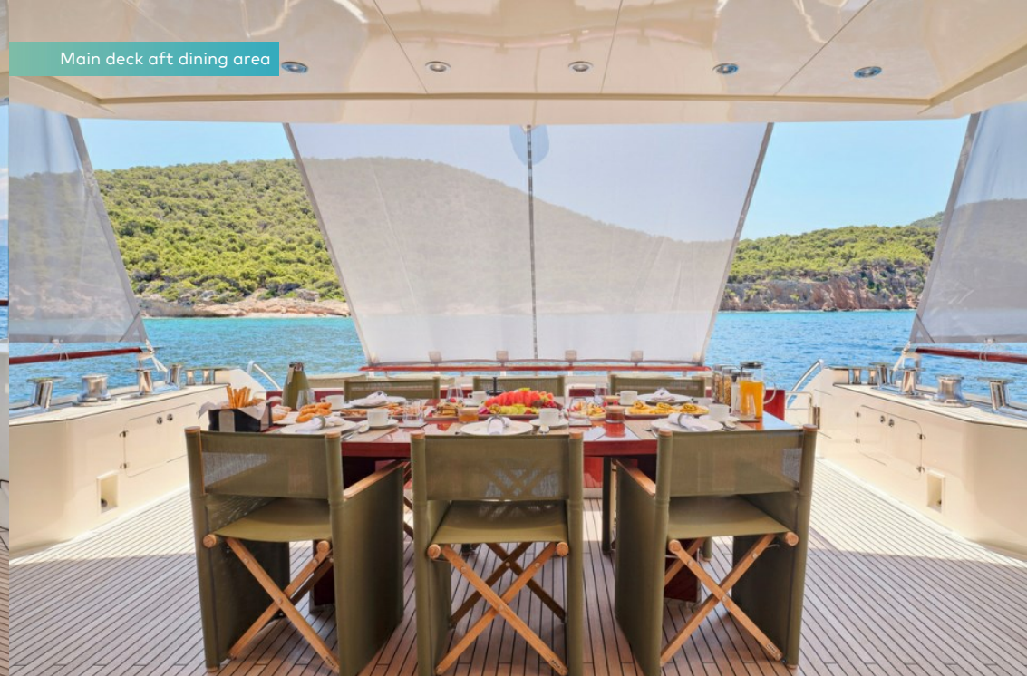
Main deck aft dining area