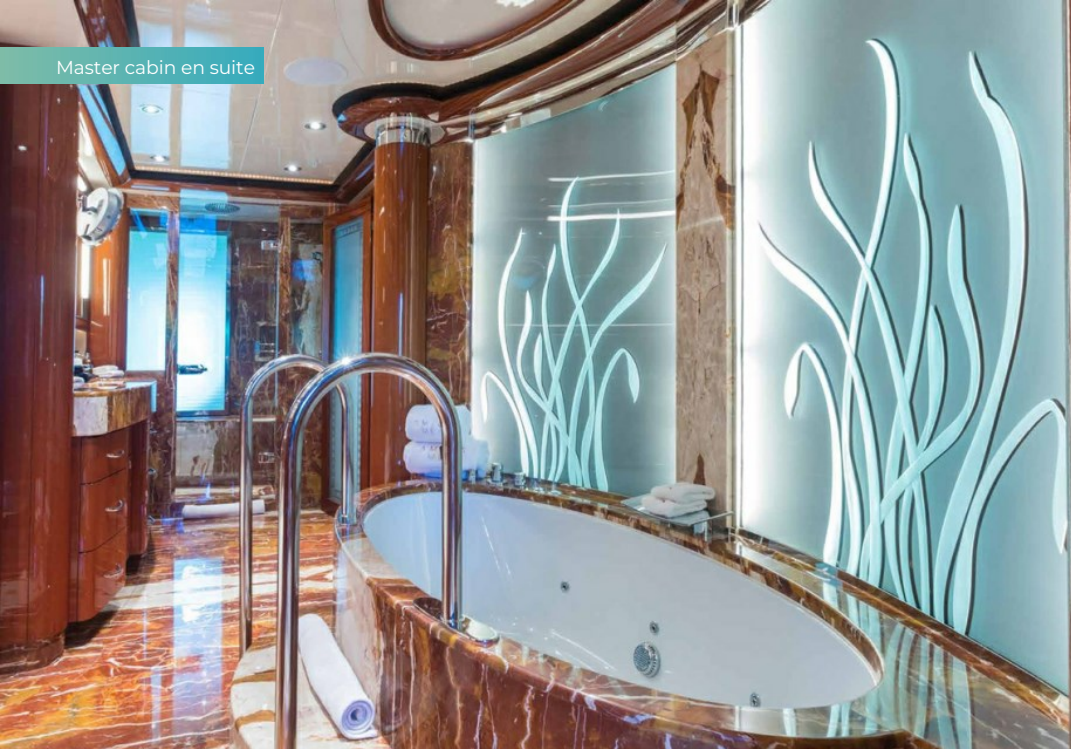
Master cabin en suite