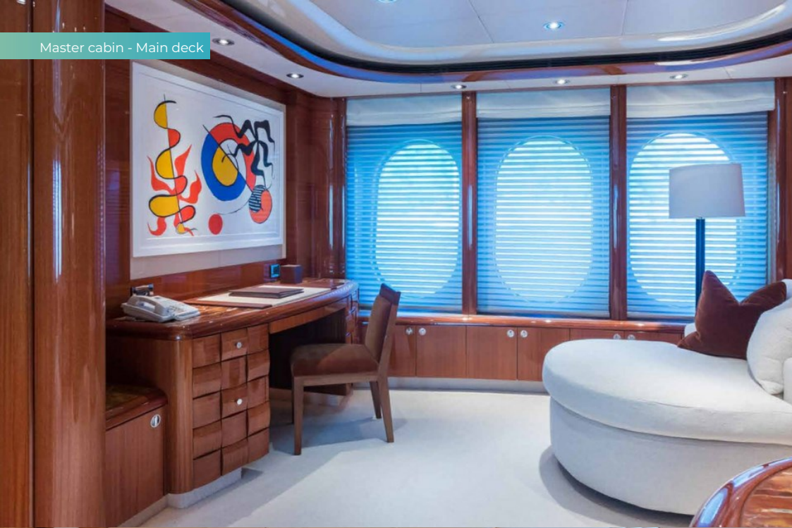
Master cabin - Main deck