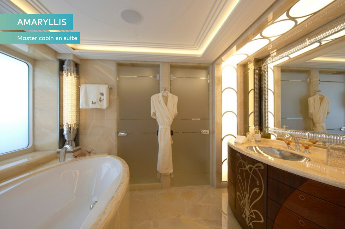
Master cabin en suite