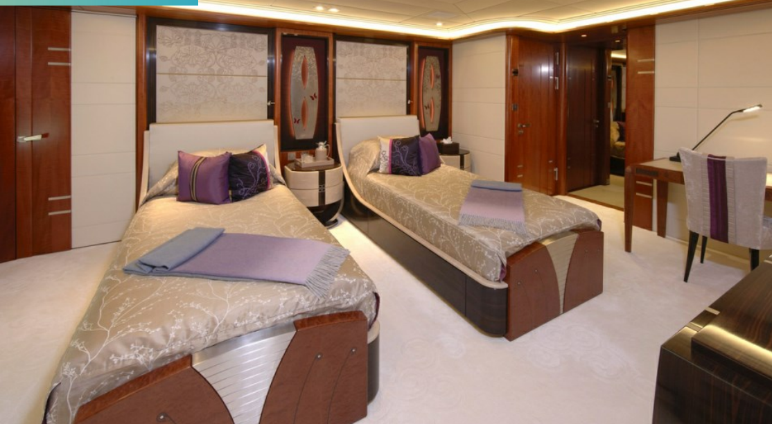
Twin cabin - Lower deck