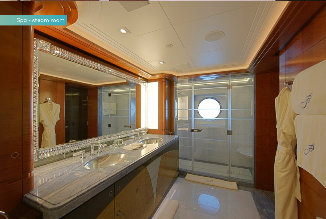
Spa - steam room