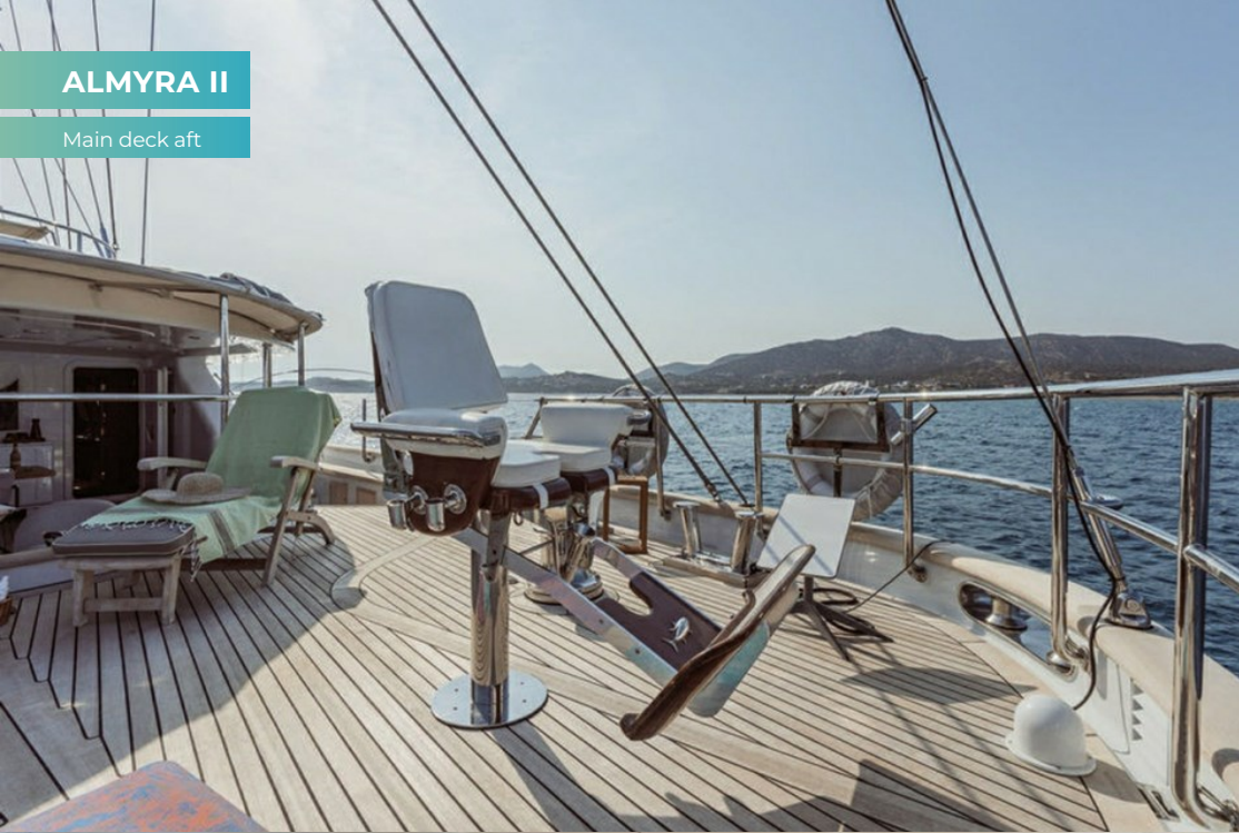
Main deck aft seating area