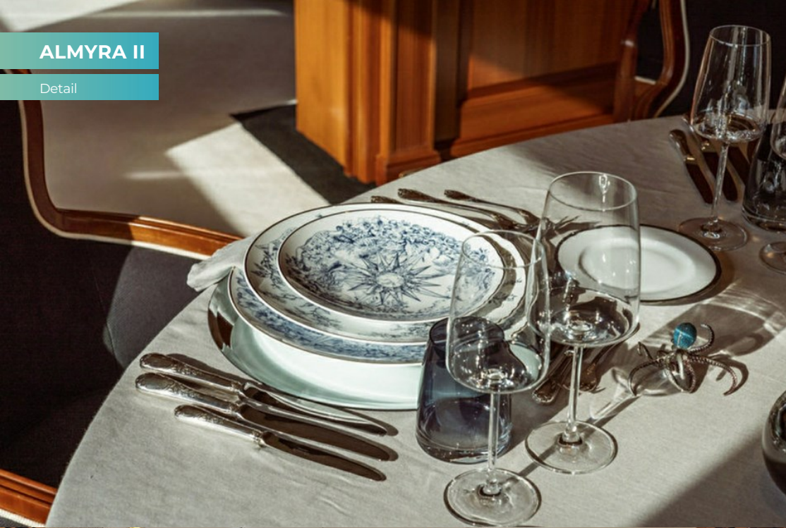
Main deck bar