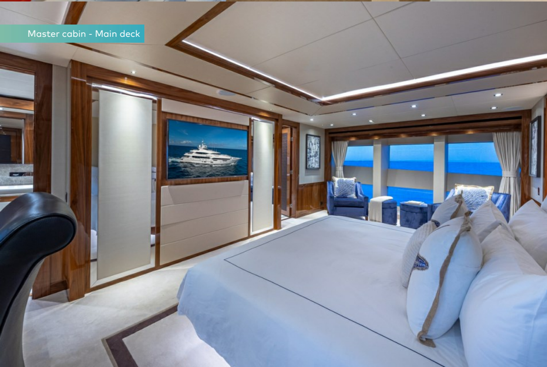
Master cabin - Main deck