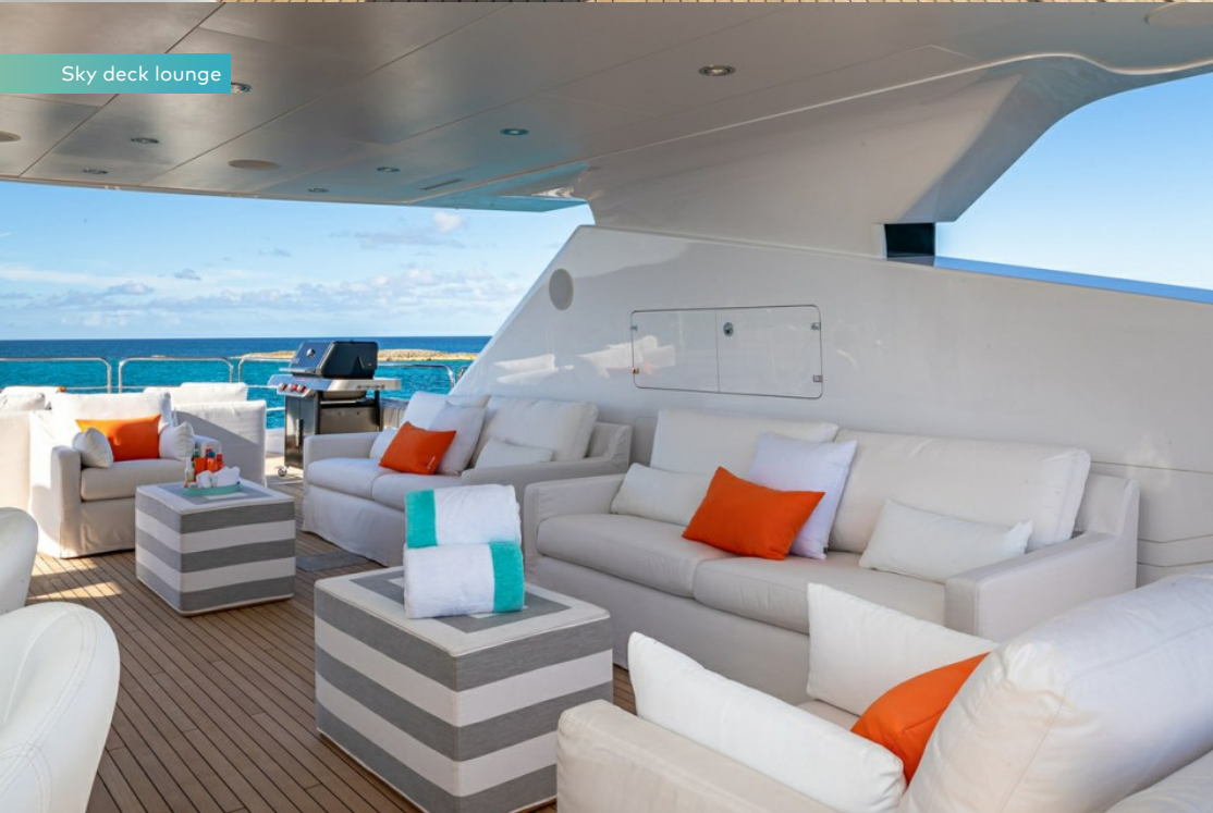
Sky deck lounge