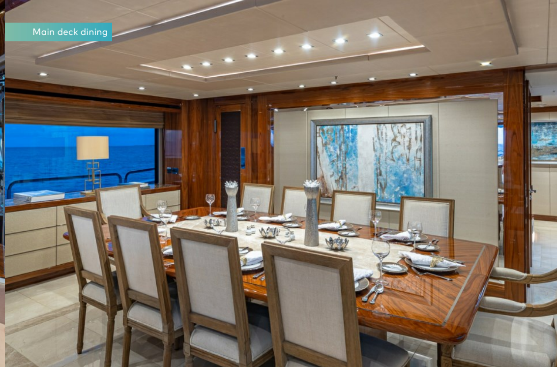
Main deck dining