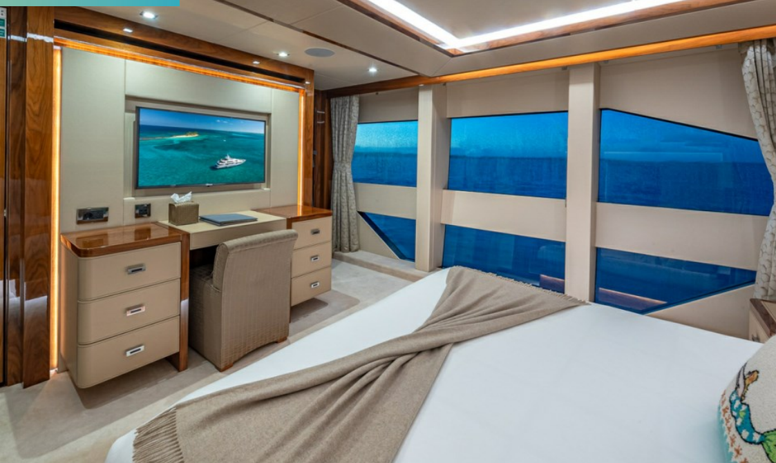
VIP cabin - Main deck