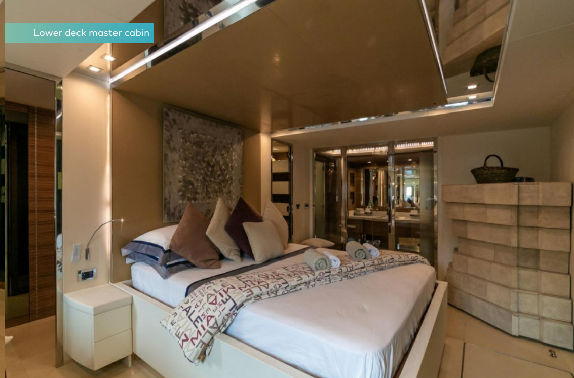
Lower deck master cabin