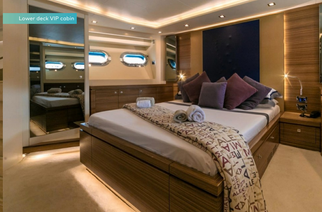
Lower deck VIP cabin