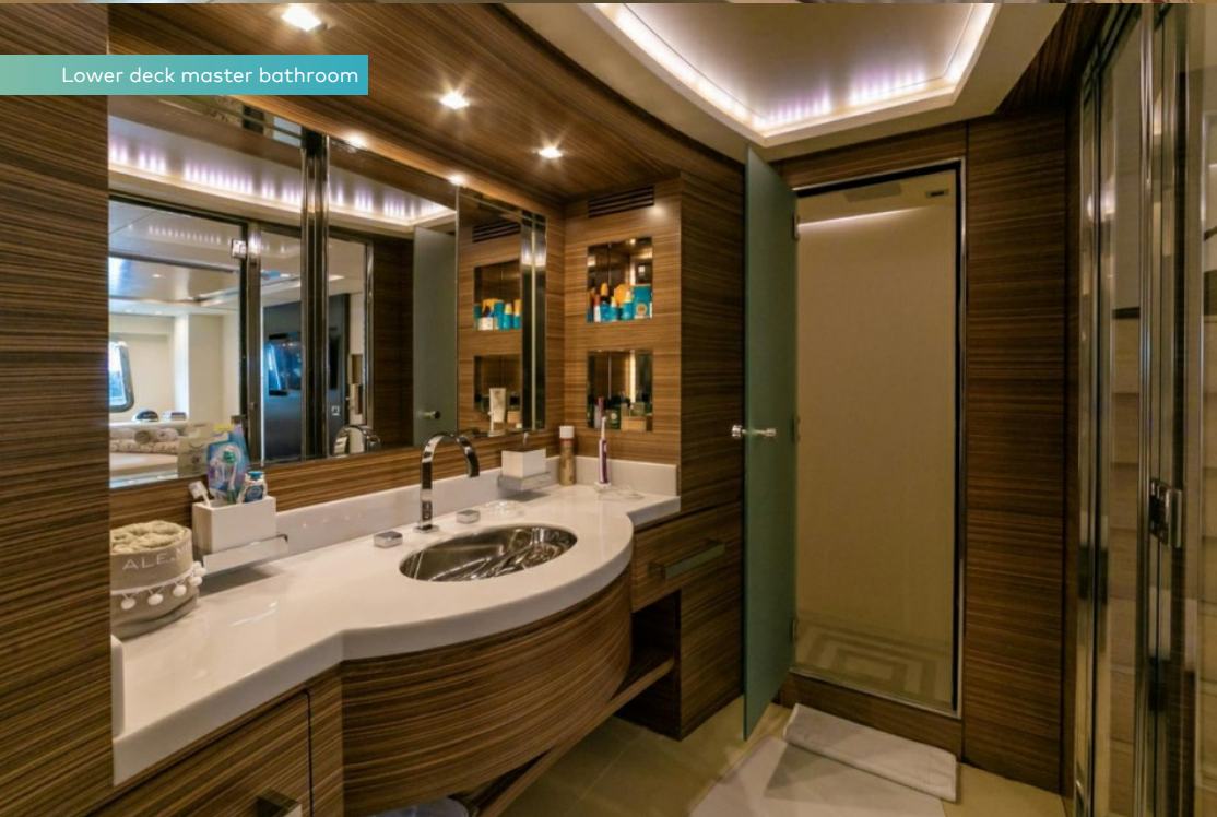
Lower deck master bathroom