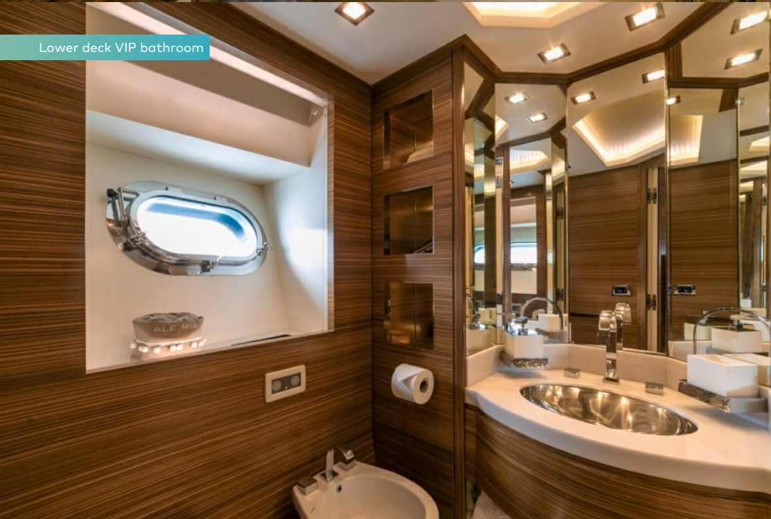
Lower deck VIP bathroom