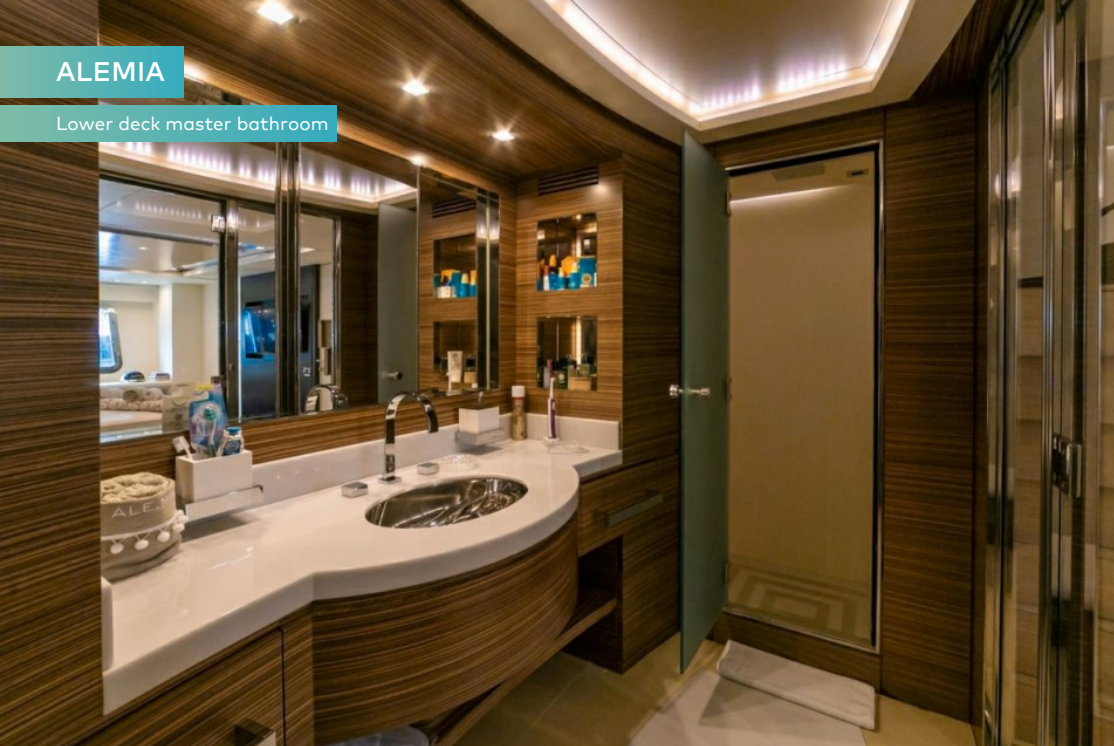
Lower deck master bathroom