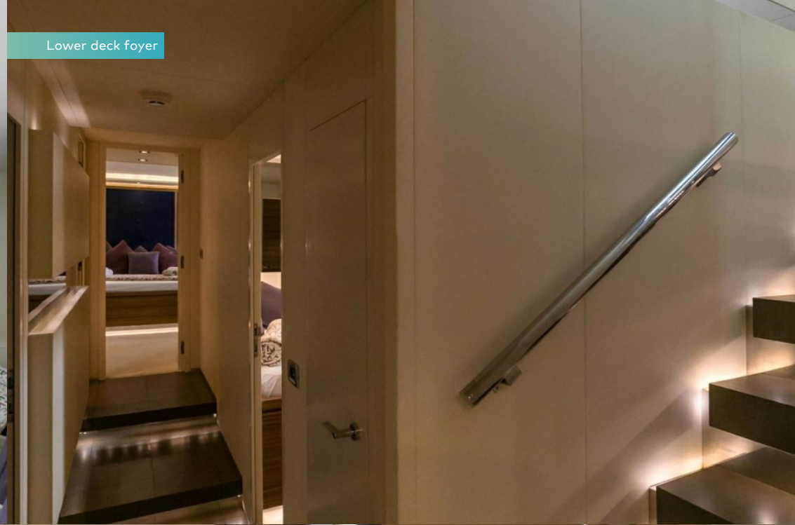
Lower deck foyer