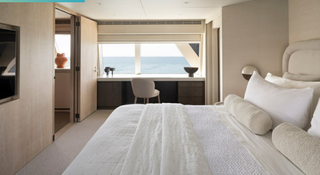
Bridge deck master cabin