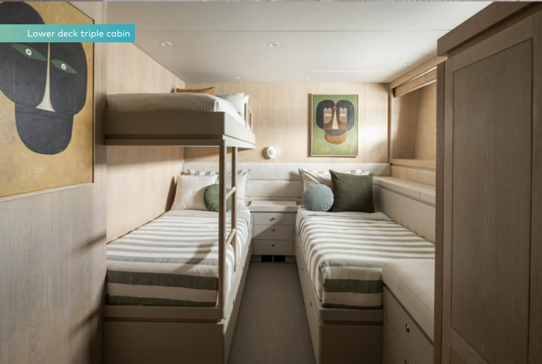
Lower deck triple cabin