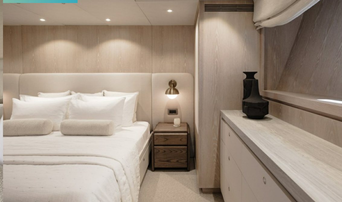
Lower deck triple cabin