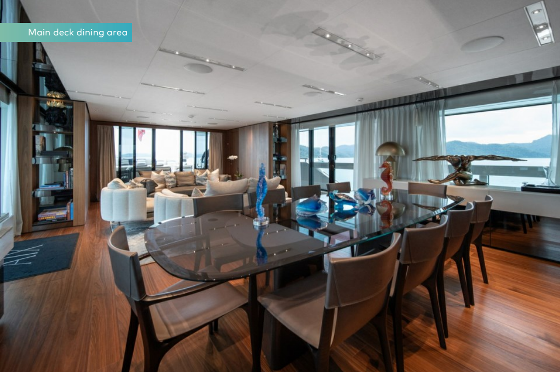
Main deck dining area