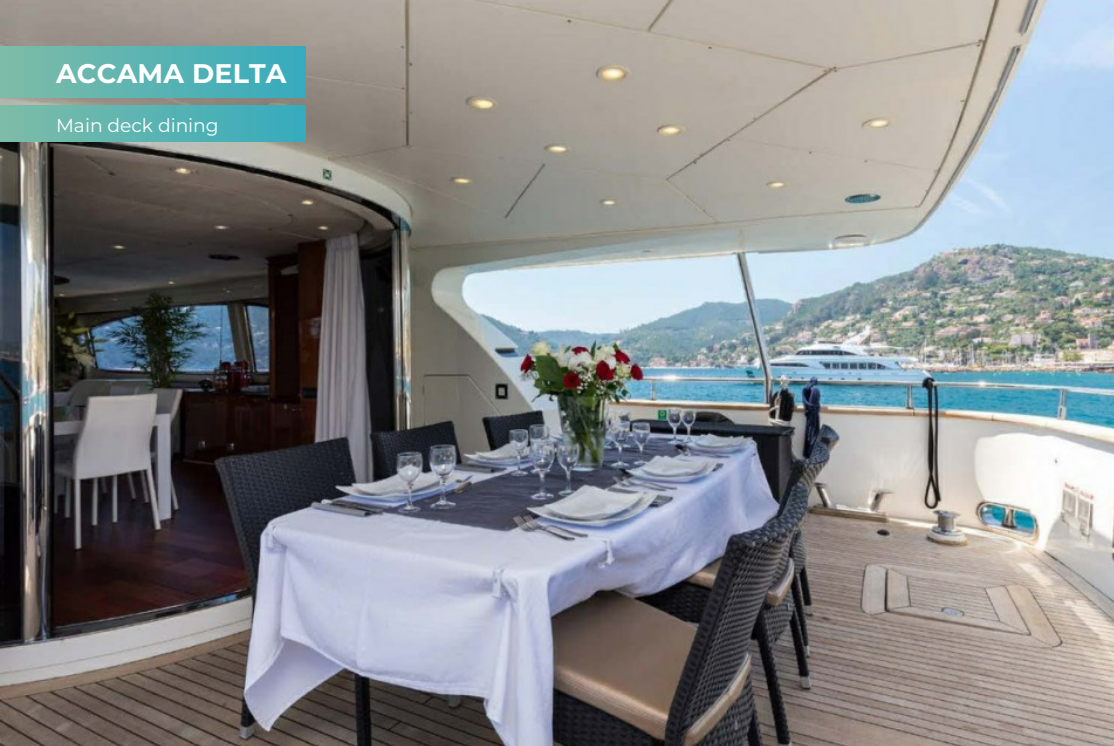
Main deck dining